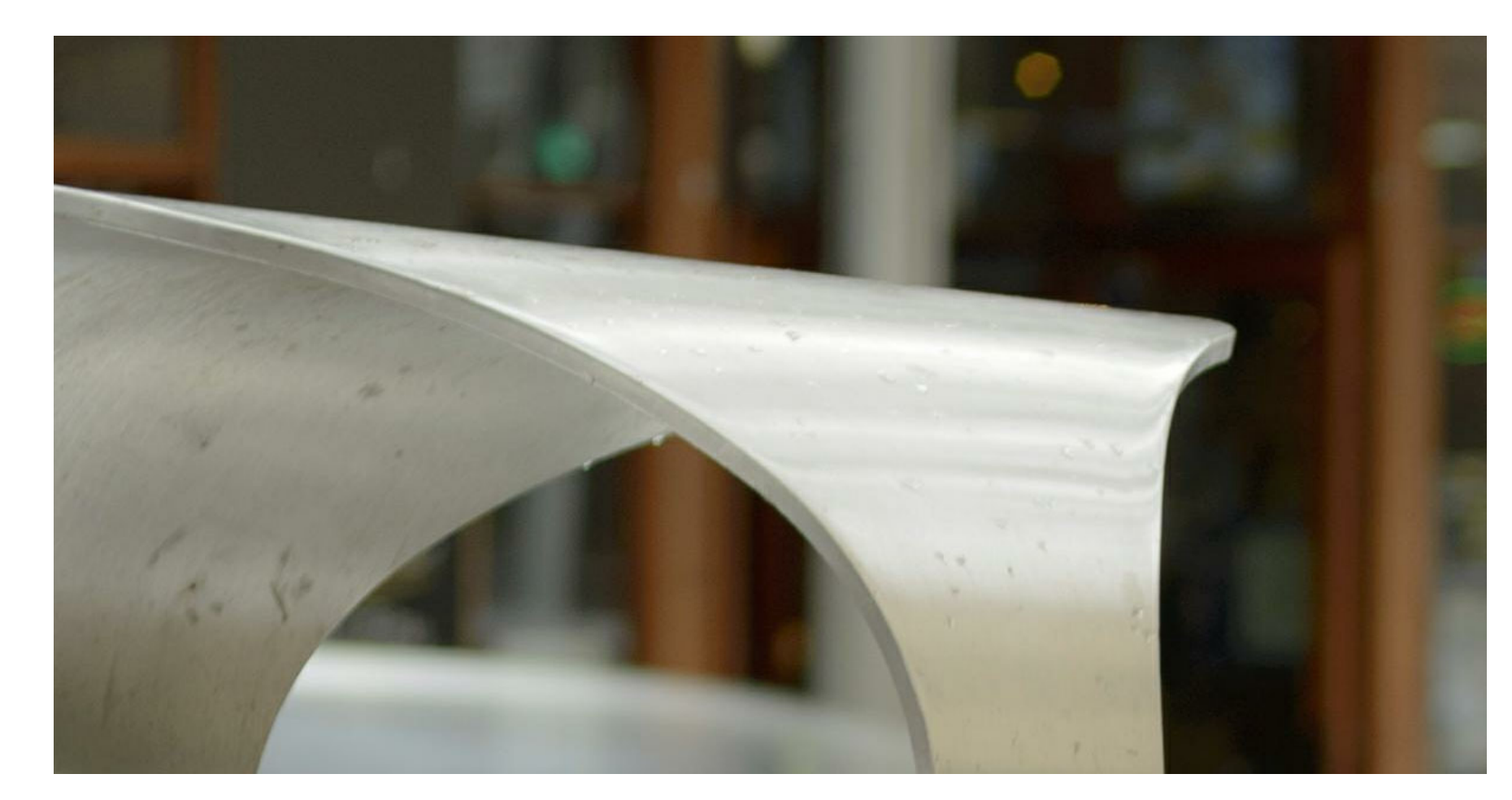
Semi-polished 316 Stainless Steel Cladding (smooth finish)