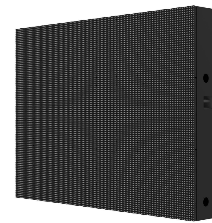
LED digital display screen