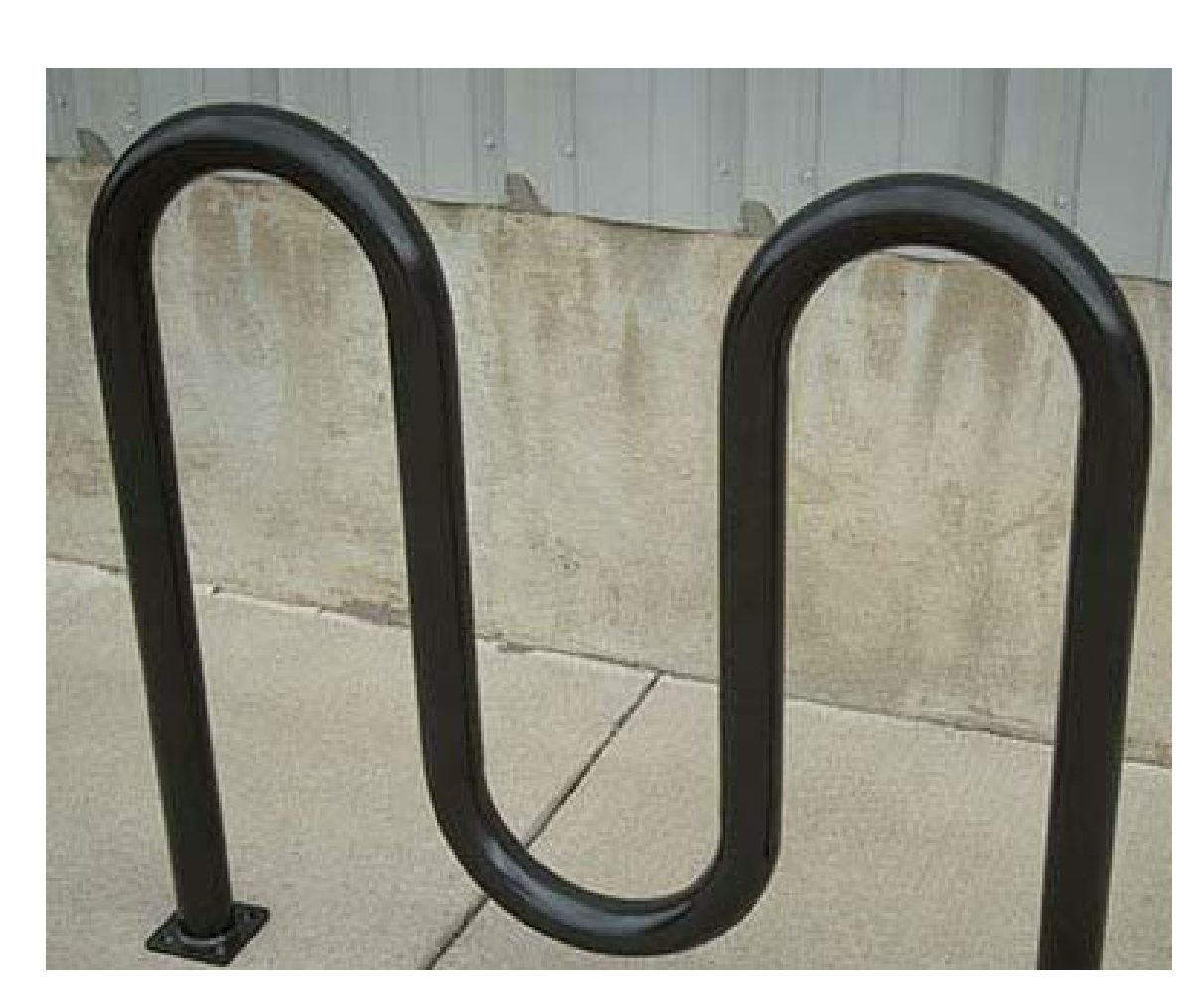
Satin black powder coated aluminium frame